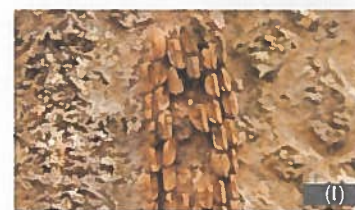
(A) Spotted lanternfly adult showing the forewings and hind wings (B) Adults at rest on bark (C) Lateral view of an adult (D) 1st instar nymph (E) 4th instar nymph (F) Adult feeding on wild grape, Vitis sp. (G) Weeping sap trail on bark (H) Egg mass (oothecum) covered in coating (I) Old hatched egg mass on tree trunk.